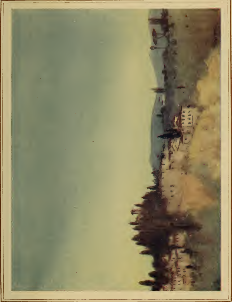
EVENING AT THE PIAZZALE MICHELANGELO, LOOKING WEST